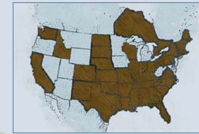
Wahoo Docks Dealer Map

These representatives are charged with understanding the vision and goals of their customers and ultimately